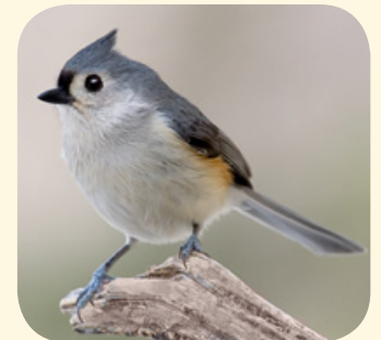
Tufted Titmouse by Trevor Hodgson

Titmice are a true joy to watch, whether they are hanging from branches and picking off insects, rummaging through the leaf litter for a tasty meal, or taking one seed at a time to hide in bark crevices for the coming winter.