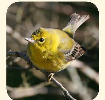
Pine Warbler by Dan Vickers

The Pine Warbler, Dendroica pinus , is aptly named as it is found almost exclusively in pine stands of the Southeastern United States. It is one of the only warblers that stay in Georgia year round, giving us a few colorful splashes of yellow on drab winter days.