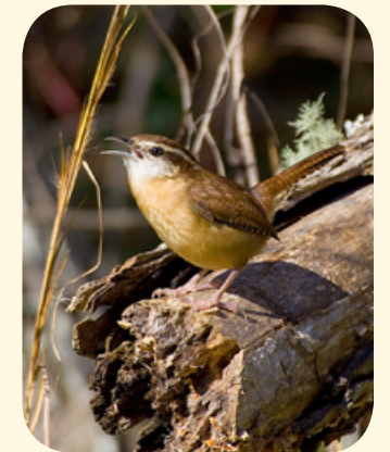
Carolina Wren

If you have ever seen a small "branchy" nest in your rain gutters, empty pots, old shoes or hanging plants, chances are it belongs to a Carolina Wren, Thryothorus ludovicianus . This spirited bird is often found near human establishments such as parks and gardens, as well as in natural forests with dense cover from shrubs.